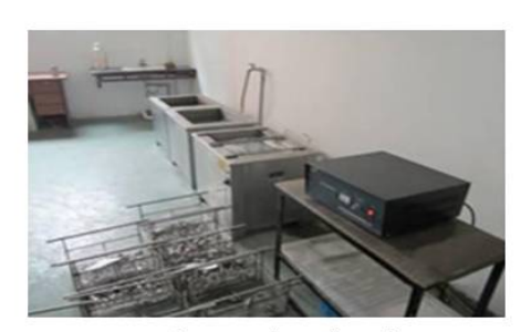
Ultrasonic Cleaning Instrument