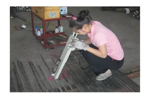
Check raw material