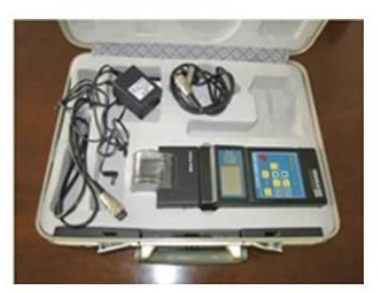
Coating sickness gauge