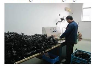
Pressure testing room