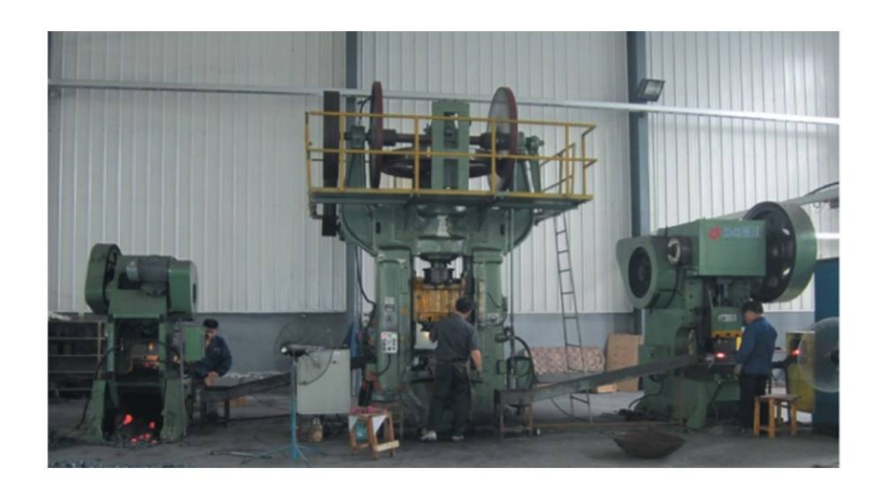
Forging & Punching Machine Model: